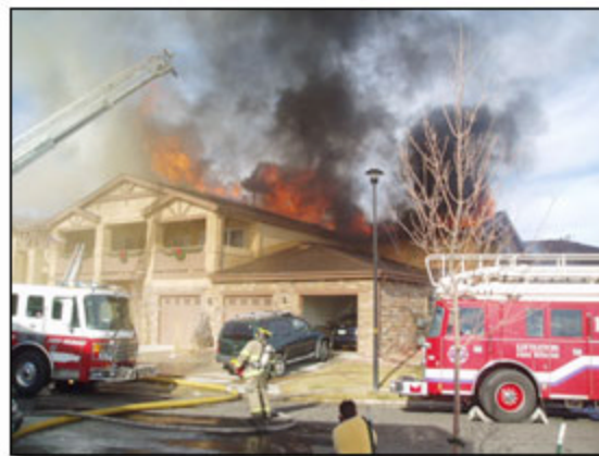
Crews attack the condo complex fire from the roof. Dec. 25, 2003.